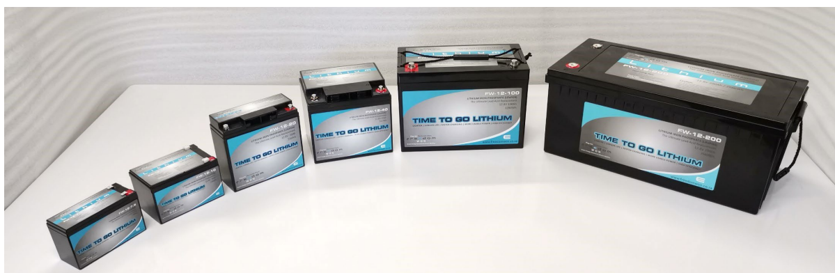
Figure 2.1 Image of the Freedom Won 12V General Purpose range

All models operate at a nominal voltage of 12,8V, which suits the most commonly available residential battery inverters and is also matched to vehicle 12V alternators.